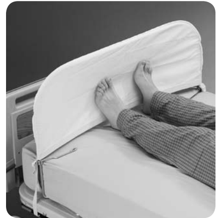
6436 and 6430 Shown with optional Foot Support Cover