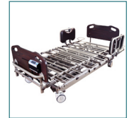
39", 42", 48", 54"